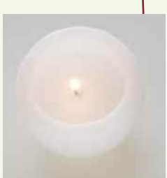
Deco Mini (#542) White