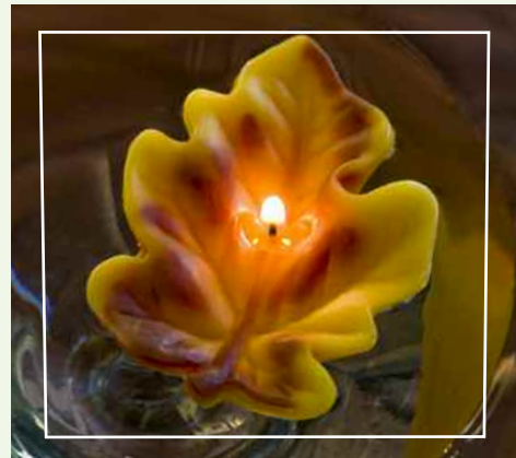
FAR LEFT: Leaf Cluster (#694) 3: Burns up to 7 hrs. Pre-assorted colors: Gold with Brick, Gold with Green LEFT: Variegated Oak Leaf (#690v) 4" - Burns up to 7 hrs Gold with Brick