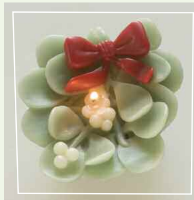
Holly Leaf (#828) 4" - Burns up to 7 hrs Green with Red Holly Wreath (#823) 3" - Burns up to 7 hrs Green with Red Mistletoe (#826) 3" - Burns up to 7 hrs Light Green with Red & Ivory