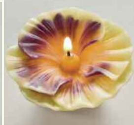
Pansy (#344) also in mini (#612) Pre-assorted colors: Yellow and Ivory with Purple