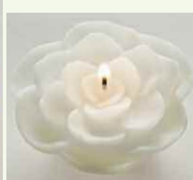
Gardenia (#320) White