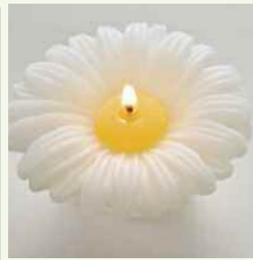
Daisy (#332) also in mini (#612) White with Yellow