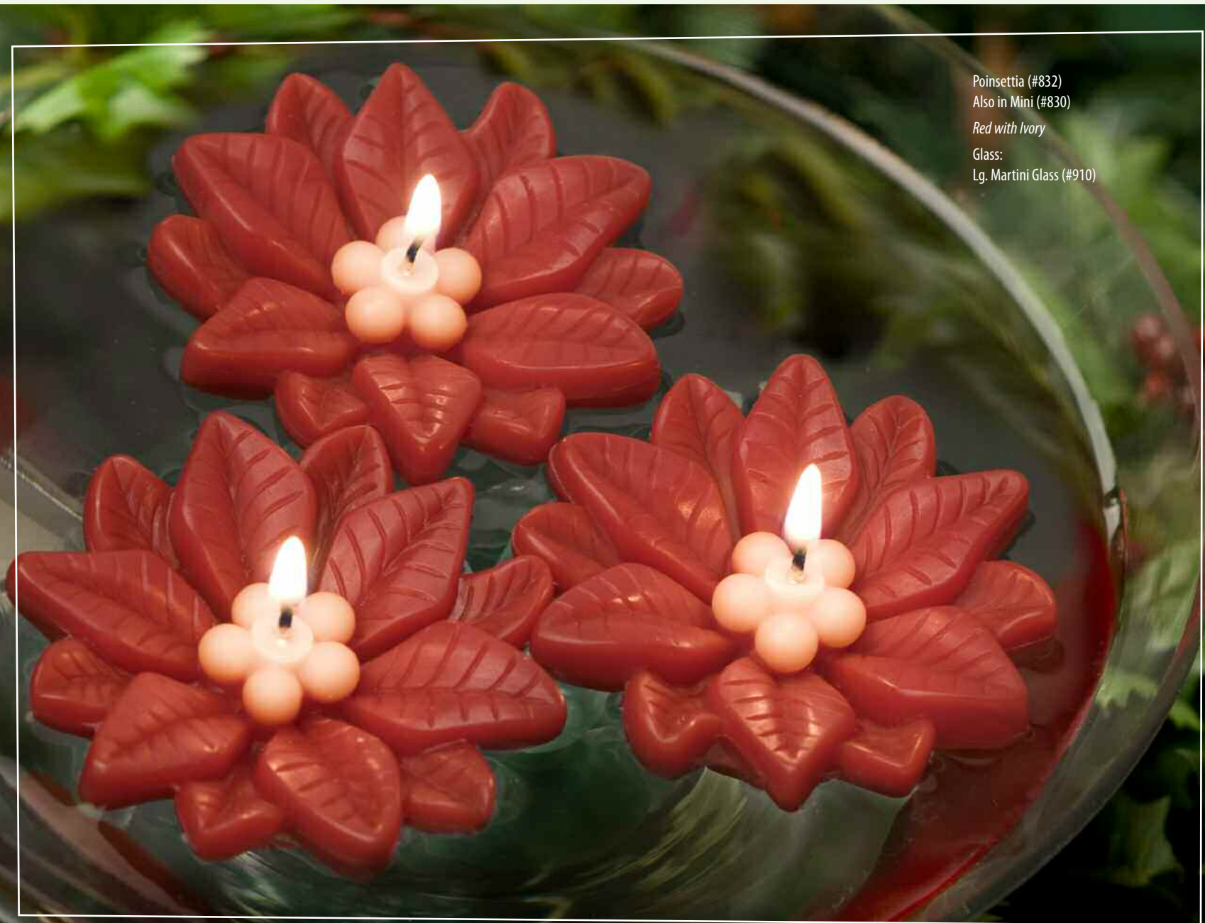
Poinsettia (#832) Also in Mini (#830) Red with Ivory Glass: Lg. Martini Glass (#910)