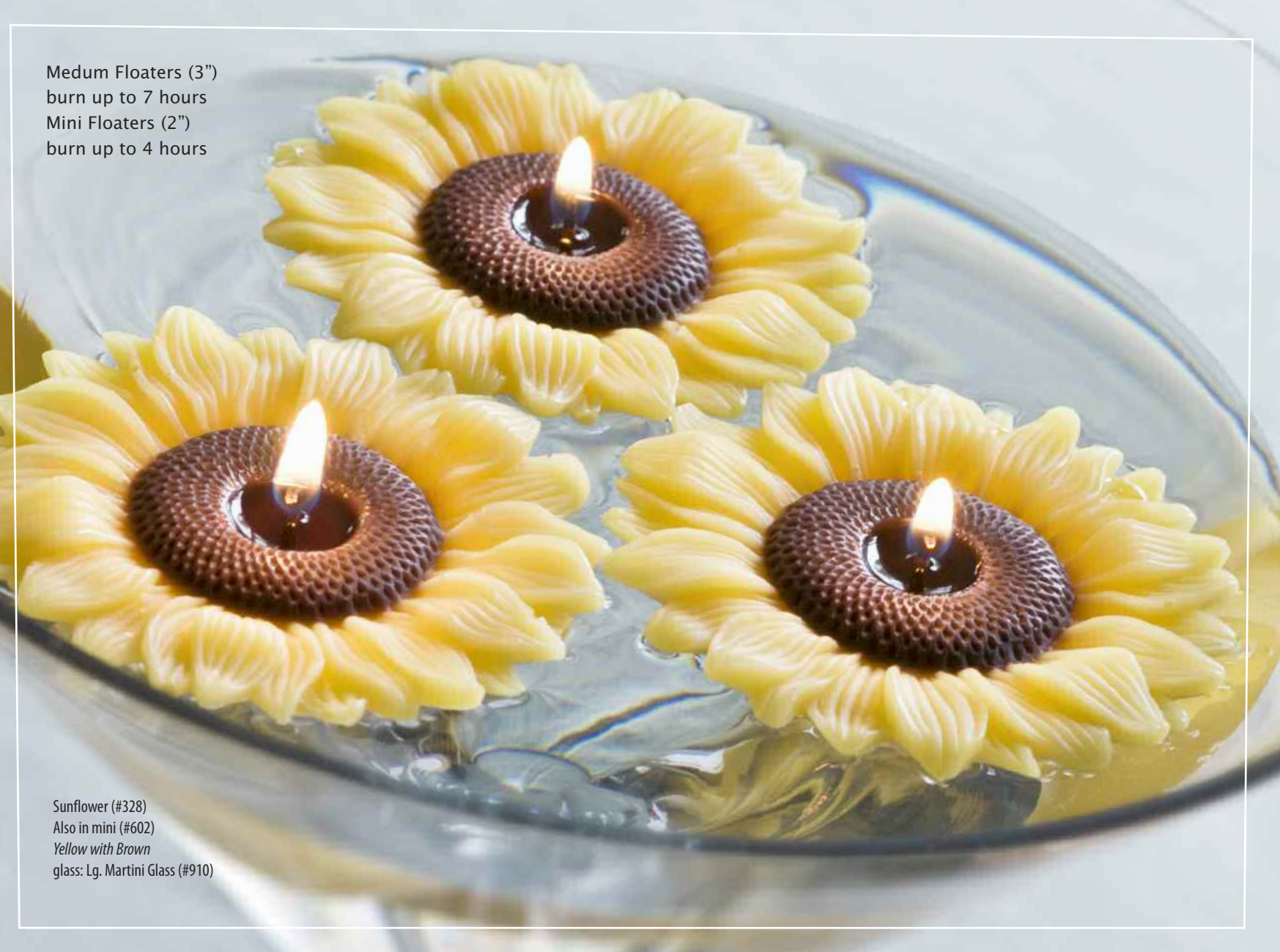
Sunflower (#328) Also in mini (#602) Yellow with Brown glass: Lg. Martini Glass (#910)

Medum Floaters (3") burn up to 7 hours Mini Floaters (2") burn up to 4 hours