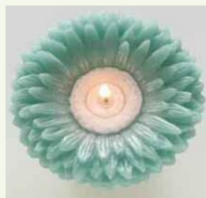
Gerbera Daisy (#360) Turquoise with White