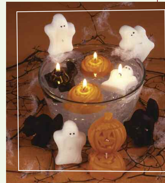
RIGHT: Halloween Floaters: Ghost (#683) 3" - Burns up to 7 hrs White Jack-o-Lantern (#684) 2" - Burns up to 7 hrs Orange Black Cat (#685) 2" - Burns up to 7 hrs Black