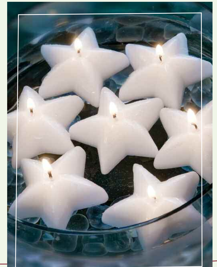
Glitter Star (#663) 3" - Burns up to 7 hrs White with glitter