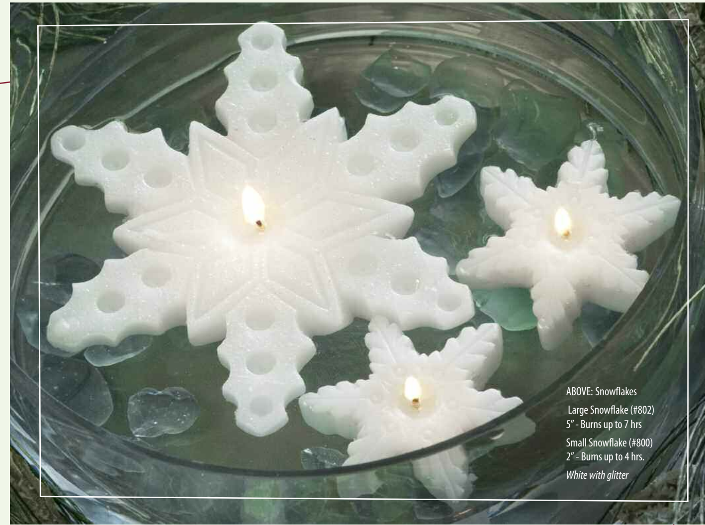
ABOVE: Snowflakes Large Snowflake (#802) 5" - Burns up to 7 hrs Small Snowflake (#800) 2" - Burns up to 4 hrs. White with glitter