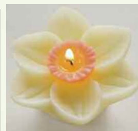
Daffodil (#609) also in mini (#612) Pre-assorted colors: Ivory with Pink, purple & yellow