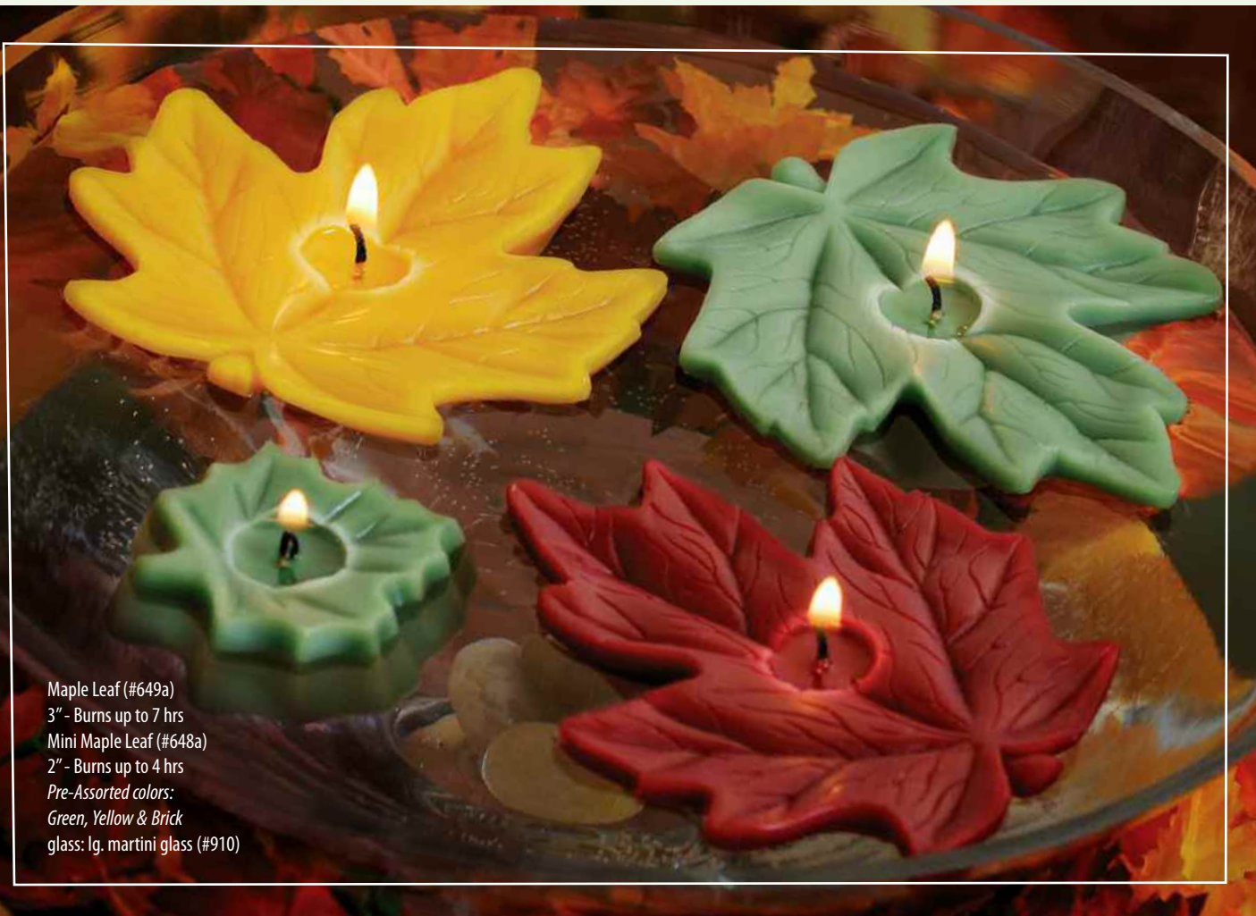
Maple Leaf (#649a) 3" - Burns up to 7 hrs Mini Maple Leaf (#648a) 2" - Burns up to 4 hrs Pre-Assorted colors: Green, Yellow & Brick glass: lg. martini glass (#910)