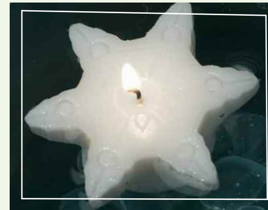
Med Snowflake (#801) 3" - Burns up to 7 hrs White with glitter

For some folks, the Christmas spirit lasts all year long. Capture Snowy nights and Starry skies with sparkling water and glowing candles. Rich red Poinsettias and romantic Mistletoe are perfect companions for holiday parties and hostess gifts.