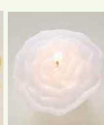
Carnations (#619) White