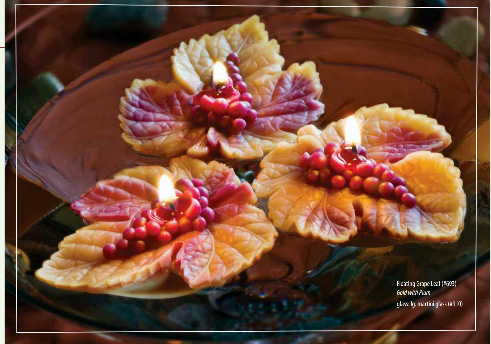
Floating Grape Leaf (#693) Gold with Plum glass: lg. martini glass (#910)