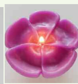
Plumeria (#628) Hot Pink