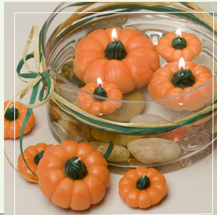
LEFT: Floating Pumpkins: Large Pumpkin (#682) 4" - Burns up to 12 hrs Med. Pumpkin (#681) 3" - Burns up to 7 hrs Mini Pumpkin (#680) 2" - Burns up to 4 hrs Orange with Green