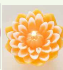
Dahlia (#340) Apricot with White