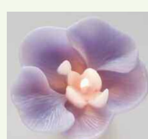
Orchid (#364) Lilac or Blue