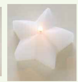
Stars (#661) Also in Mini (#660) Red, White, Blue